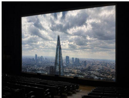
Inferno