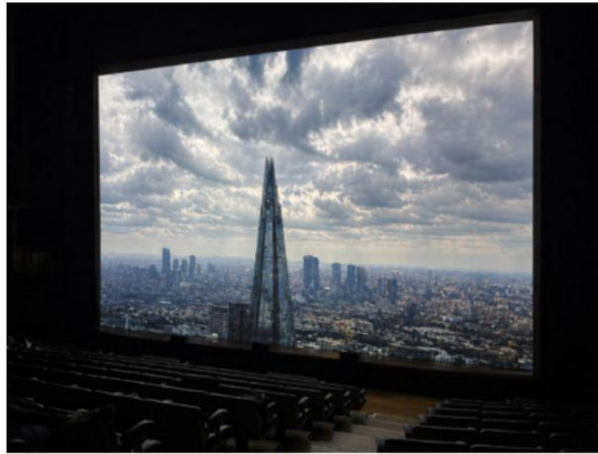
Inferno © Mat Collishaw